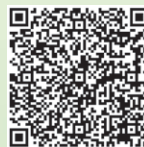
Company Account 公司戶口