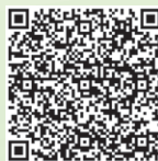
Personal Account 個人戶口